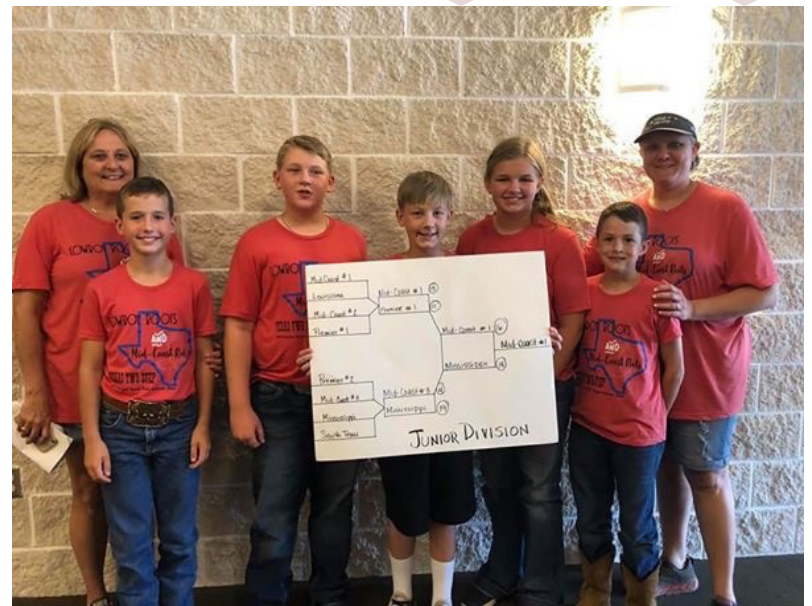
The Mid-Coast Junior Brain Bowl Team lands First Place after a long-fought battle against the Mississippi junior team.