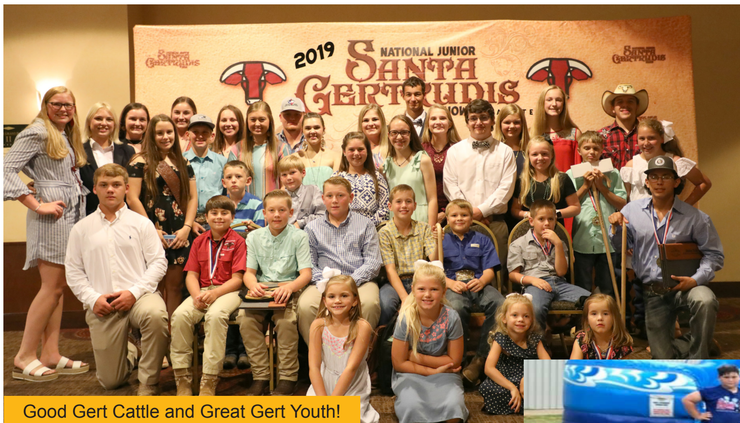
Good Gert Cattle and Great Gert Youth!