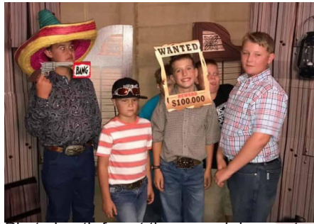
Photo booth fun at the annual dance at Junior Nationals.