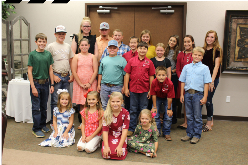
Below: Junior Mid-Coast Santa Gertrudis Members