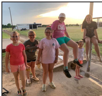
Above: Mid-Coast Juniors resting in the shade