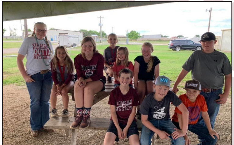
Above: Mid-Coast Juniors taking a break in the shade