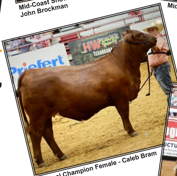
National Champion Female - Caleb Bram