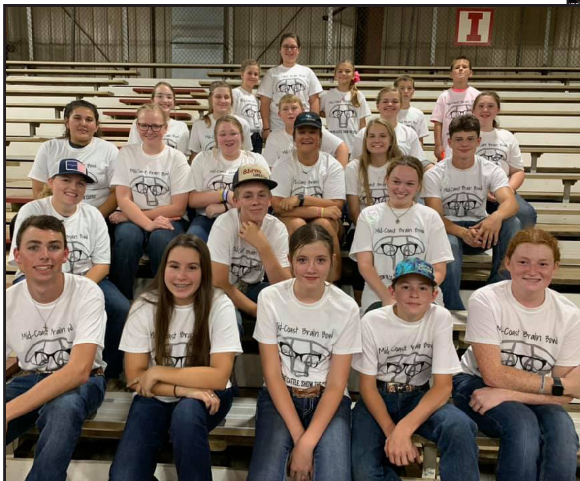
Left: 24 Mid-Coast Juniors participated in the NJSGS Brain Bowls on 6 Mid- Coast Teams.