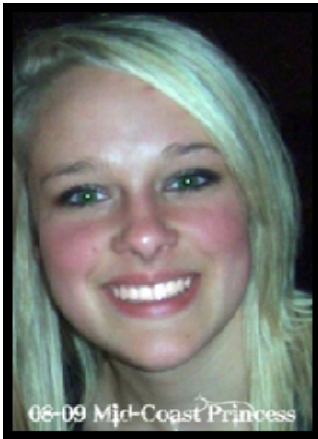
2008-2009 Mid-Coast & National Santa Gertrudis Princess